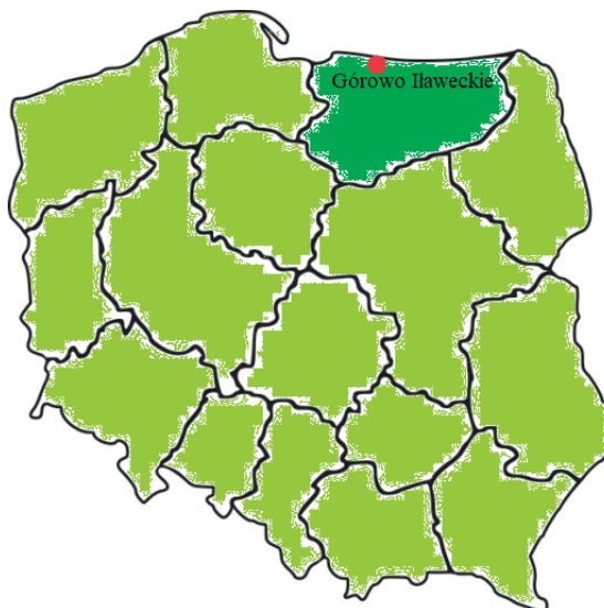
Fig. 1. Górowo Iławeckie – location on the map of Poland

The history of Górowo Iławeckie dates back to very remote times. The city was founded on Prussian-Natangia land which was conquered in the thirteenth century by the Teutonic Knights. The Prussians living in the community were the last group of pagans in Christian Europe. Herkus Monte – one of the most famous chiefs and leaders of the Prussian Uprising (1260-1274) against the Teutonic Knights 3 is connected with this region.